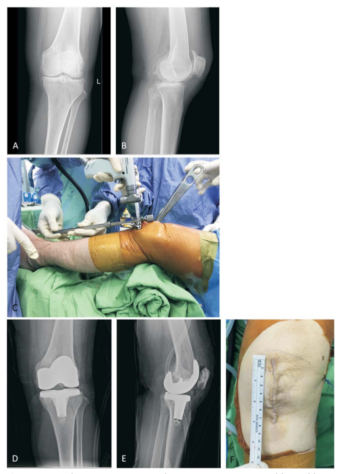
Fig. 2. Case demonstration. A and B, pre-operative AP and lateral knee radiographs. C, cutting tibia with knee in semi-extended position. D and E, post-operative radiographs. F, wound size was 8 cm (3.1 inches) in this case.